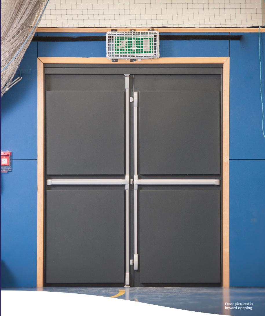
Door pictured is inward opening