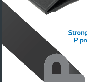
Strongdor P profile seal