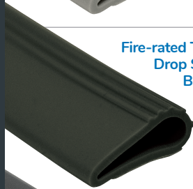
Fire-rated Tear Drop Seal Black