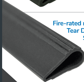
Fire-rated mini Tear Drop Seal