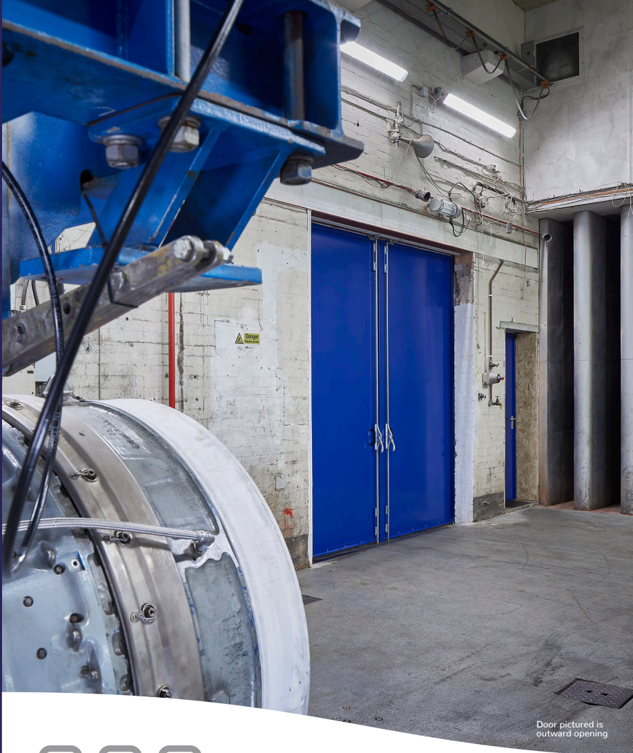
Door pictured is outward opening