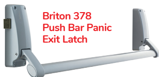
Briton 378 Push Bar Panic Exit Latch

Briton 378 rim panic latch is suitable for use on single doors and the first opening leaf of double door-set. It can be supplied in left or right hand, but can also be reversed on site. Suitable for doors up to 1300mm wide. There is a double door strike available for double rebated door applications. The panic latch is also available with manual dogging (hold open) and can be used with a rim cylinder fitted to the outside of the door.