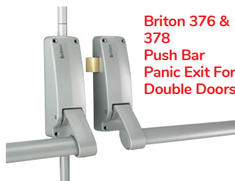
Briton 376 & 378 Push Bar Panic Exit For Double Doors

Designed for use on double door applications and to suit rebated double doors. The three point locking system is fitted with an anti thrust device to prevent unauthorised latch bolt retraction. Site reversible for left and right hand 376/378 Series is suitable for door leaves up to 2500mm high x 1300mm wide. With adjustable top and bottom shoots, it is also supplied with easy clean socket and latch keep for double door applications