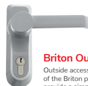
Briton Outside Access Device

Outside access device which can be used with any of the Briton panic and emergency exit devices. They provide a simple means of accessing the door from the outside. Designed to suite with all Briton CE compliant exit devices. Powder coated for additional durability.