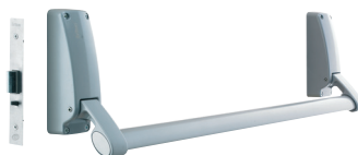
Briton 379.N - Push Bar Panic Exit With Mortice Nightlatch

The Briton 379N can be used on single doors and the first opening leaf of a double door. It consists of a single point locking system that is site reversible for left or right hand. Suitable for doors up to 1300mm wide, it is supplied with dual profile cylinder mortice nightlatch (cylinder not supplied). Anti thrust device prevents unauthorised latch bolt retraction.