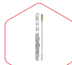
Manual Flush Bolt

High-quality finish closer with concealed fixings creating an elegant and effortless appearance.