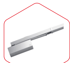
TS93 Door Closer

Concealed fix press lever handle available in 19mm diameter.