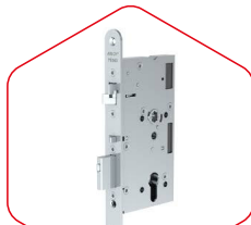
Assa Abloy EL560

Dormakaba EM7500-D Shear maglock offers a secure access control solution on fire rated doors