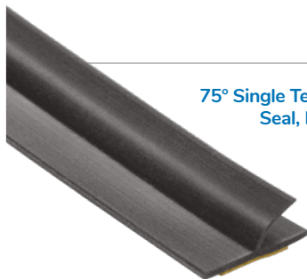
75° Single Tee Fin Seal, Black