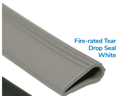
Fire-rated Tear Drop Seal White