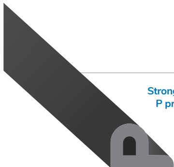
Strongdor P profile seal