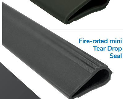
Fire-rated mini Tear Drop Seal