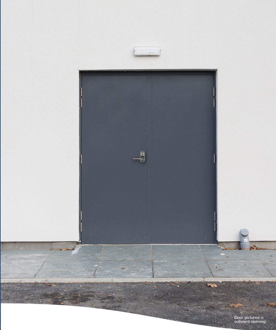
Door pictured is outward opening