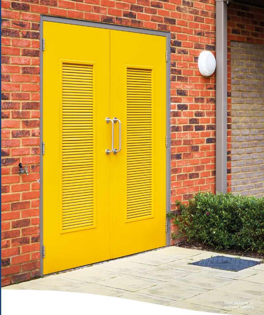
Door pictured is outward opening