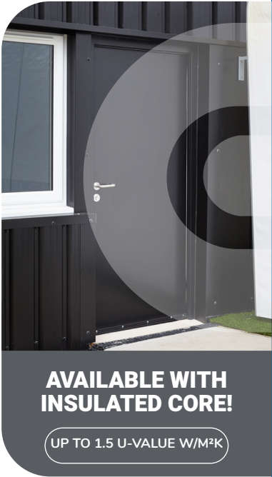
Fig.1 Single door with single rebate frame assembly

Boost safety and meet industry standards with our new Earth Bonding upgrade. This feature enhances protection by providing a secure grounding point, offering peace of mind in environments where electrical safety is critical.