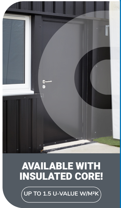
Fig.1 Single door with single rebate frame assembly

Manual and Electric Locking. Vision panels up to 610 x 1524mm. Louvre panels up to 610 x 1524mm. Variety of solid and glazed side and over panels.