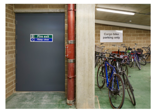
this landmark provision has put Cambridge way ahead of other cities.

The cycle park is also proving popular with local cycling groups, who say that